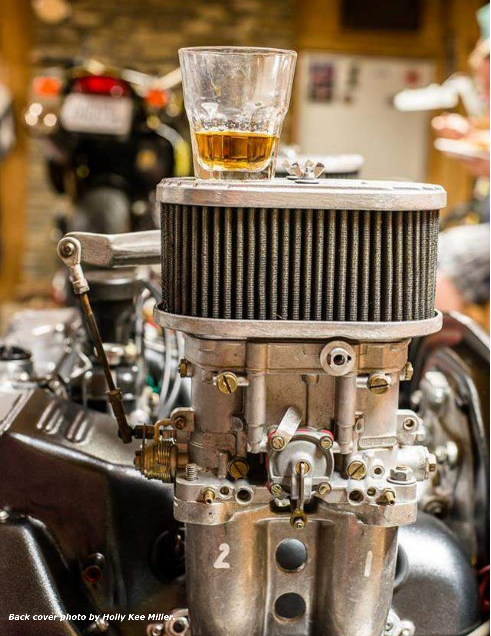
Back cover photo by Holly Kee Miller.