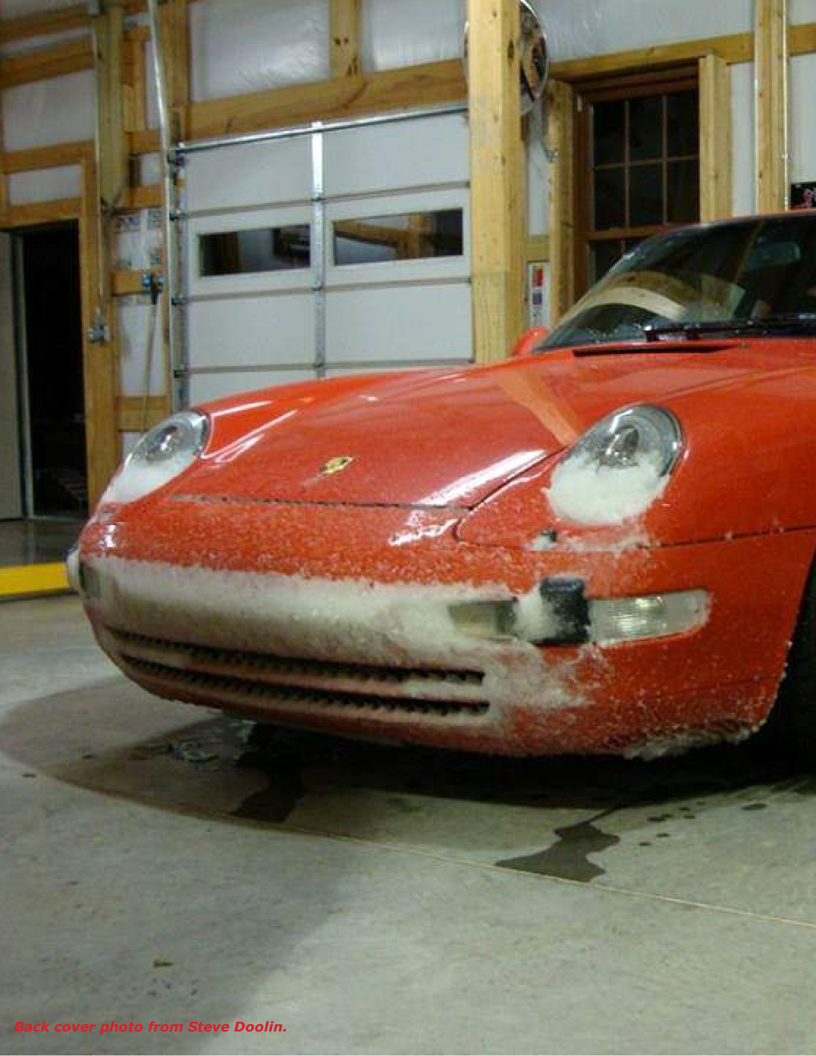
Back cover photo from Steve Doolin.