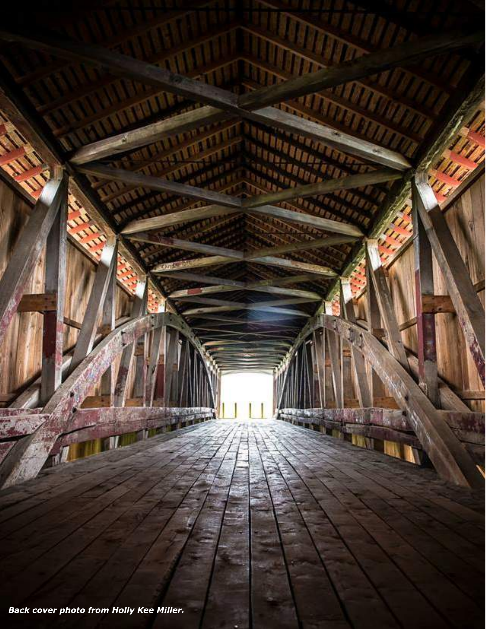
Back cover photo from Holly Kee Miller.