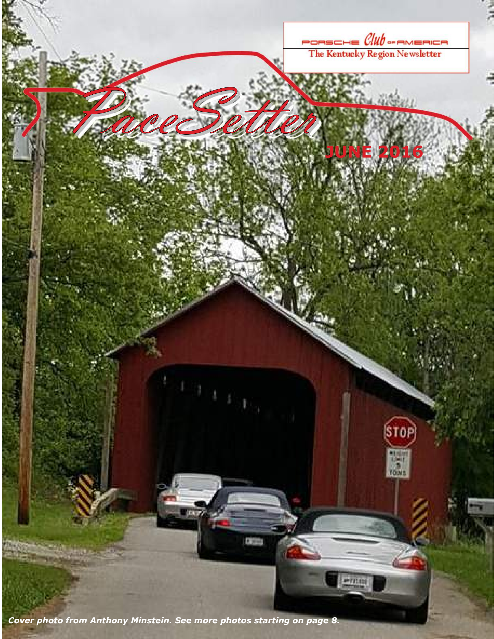
Cover photo from Anthony Minstein. See more photos starting on page 8.