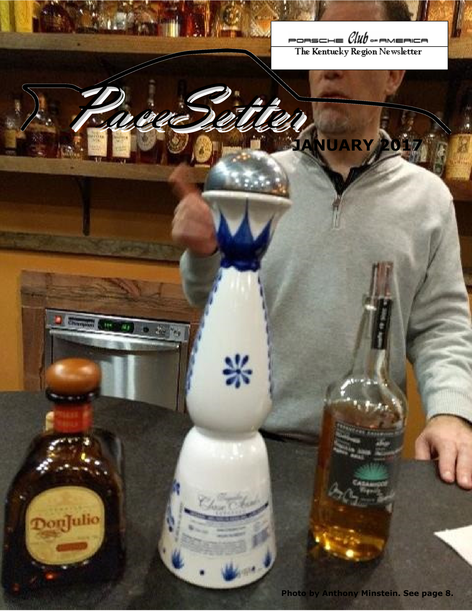
See page 8.