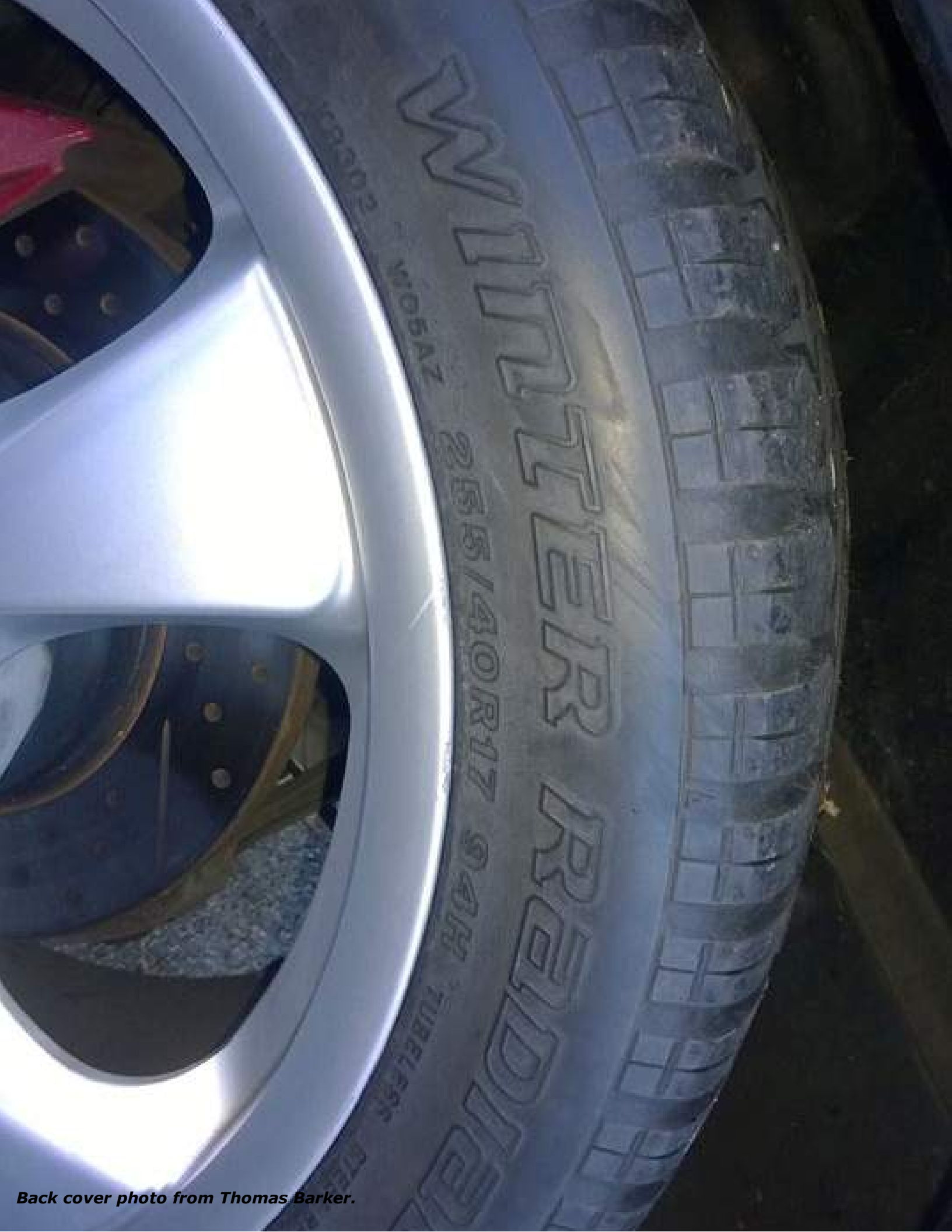
Back cover photo from Thomas Barker.