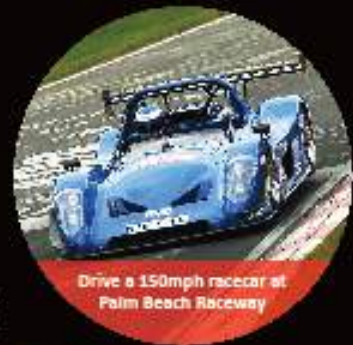
Drive a 150mph racecar at Palm Beach Raceway