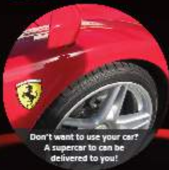
Don't want to use your car? A supercar can be delivered to you!

Former Formula One & Indycar driver Derek Daly will serve as "Master of Ceremonies"