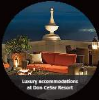
Luxury accommodations at Don CeSar Resort