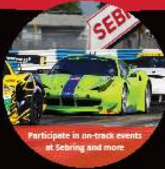
Participate in on-track events at Sebring and more