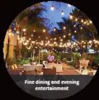
Fine dining and evening entertainment