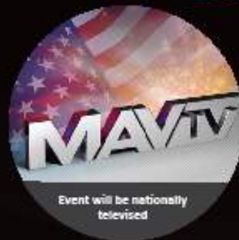
Event will be nationally televised