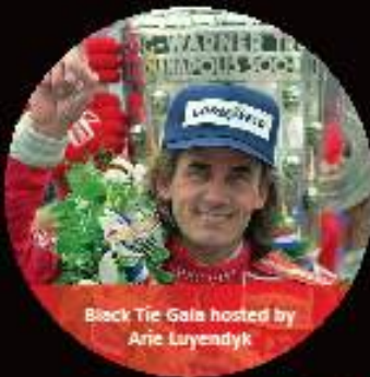
Black Tie Gala hosted by Arie Luyendyk