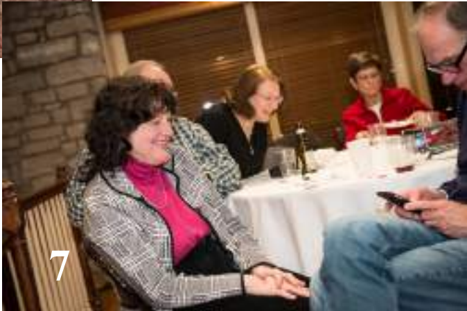
Final winner of the much traded poster!