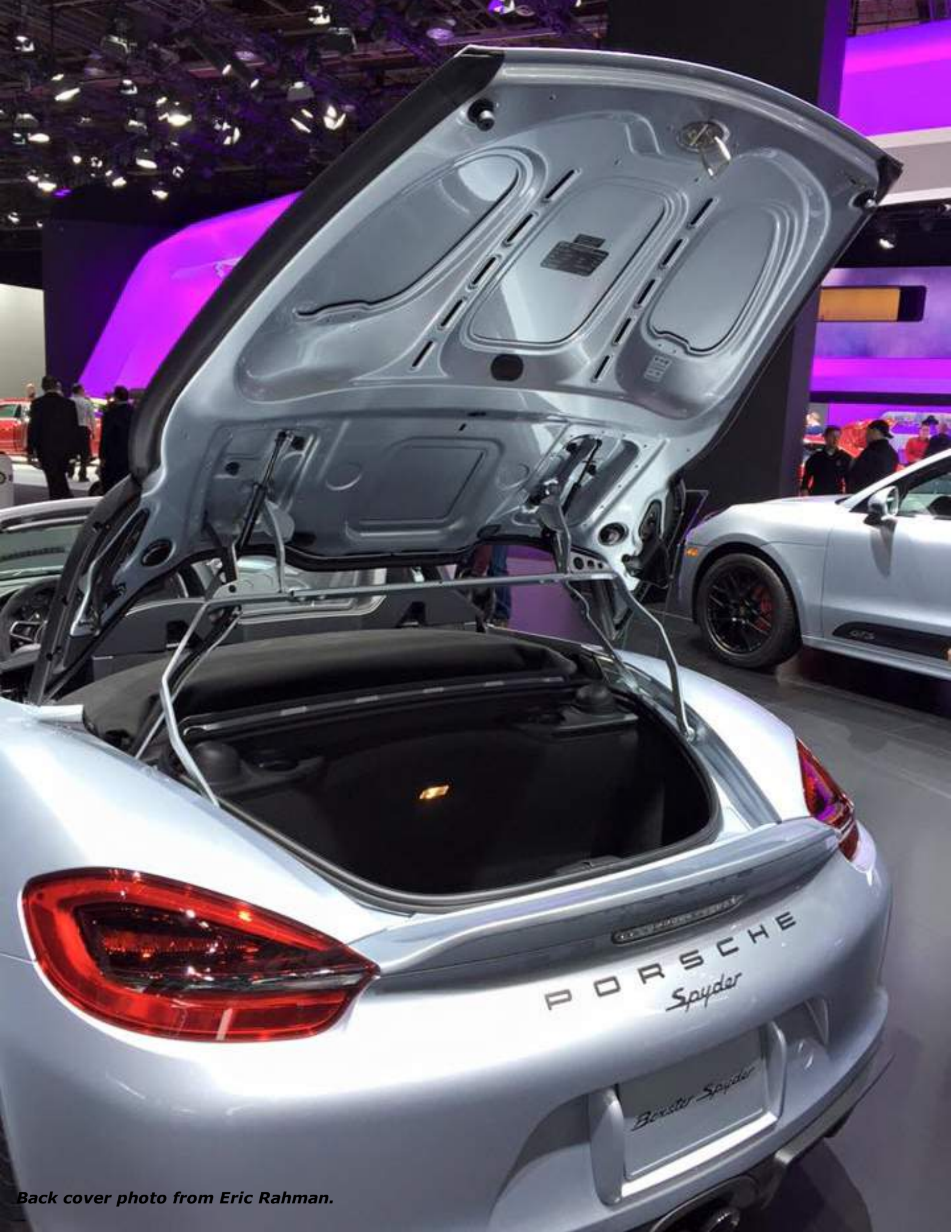
Back cover photo from Eric Rahman.