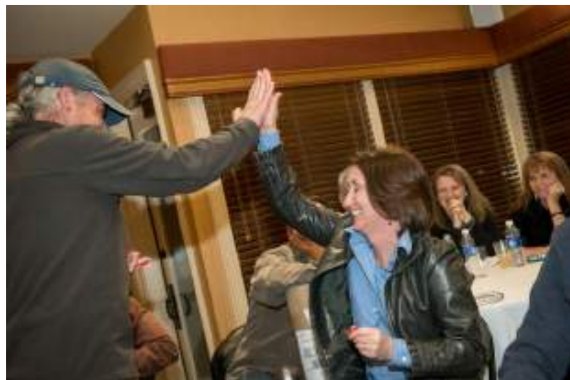
Winner of the grand prize—Prepaid DE Weekend!!