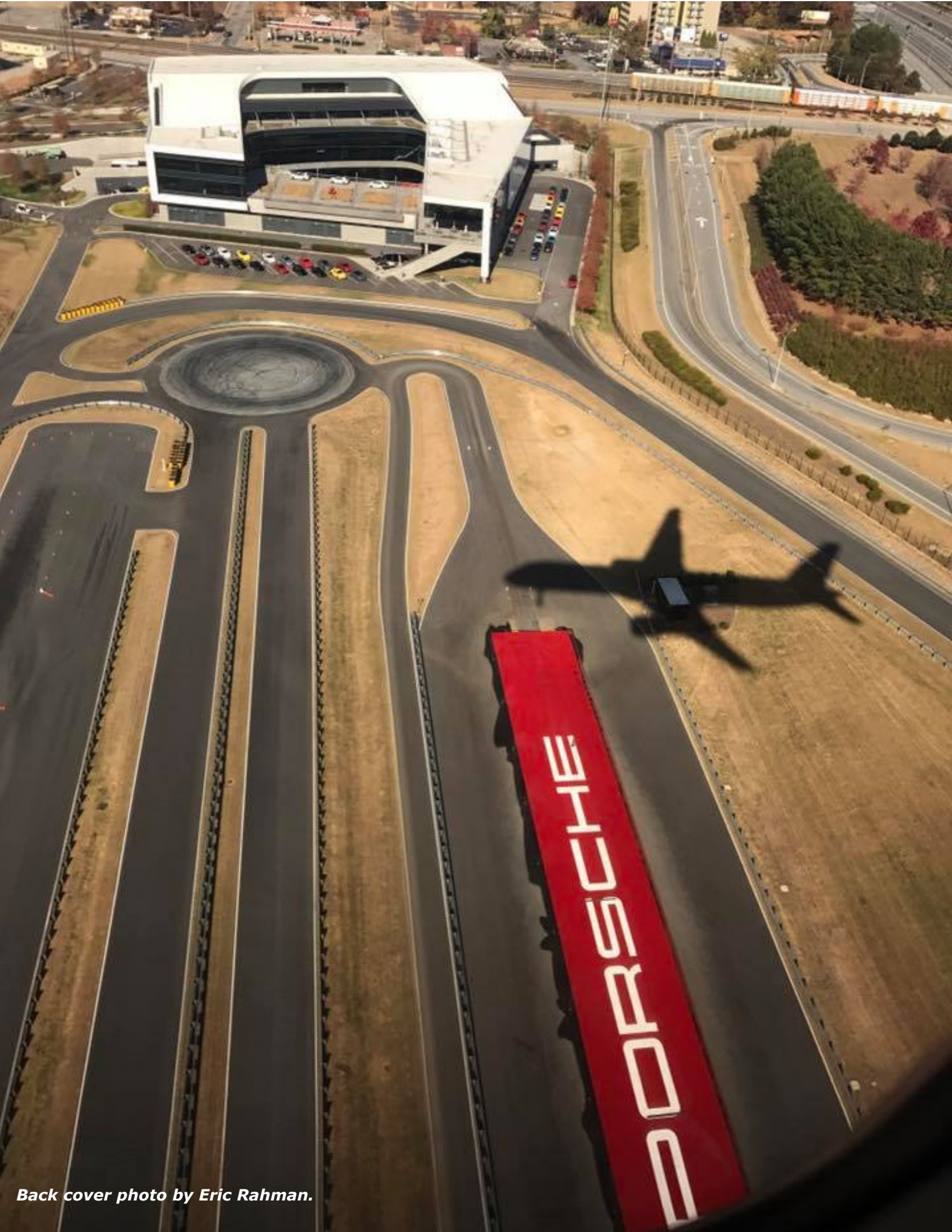
Back cover photo by Eric Rahman.