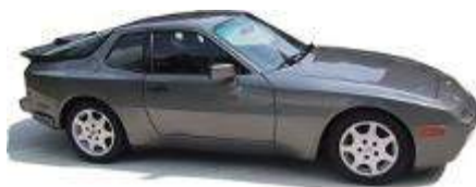
1989 944 Turbo S

The last time Porsche offered a four-cylinder turbocharged engine in one of their sports car was over 20 years ago in the 1989 944 (951) Turbo S and the 1994 968 Turbo S.