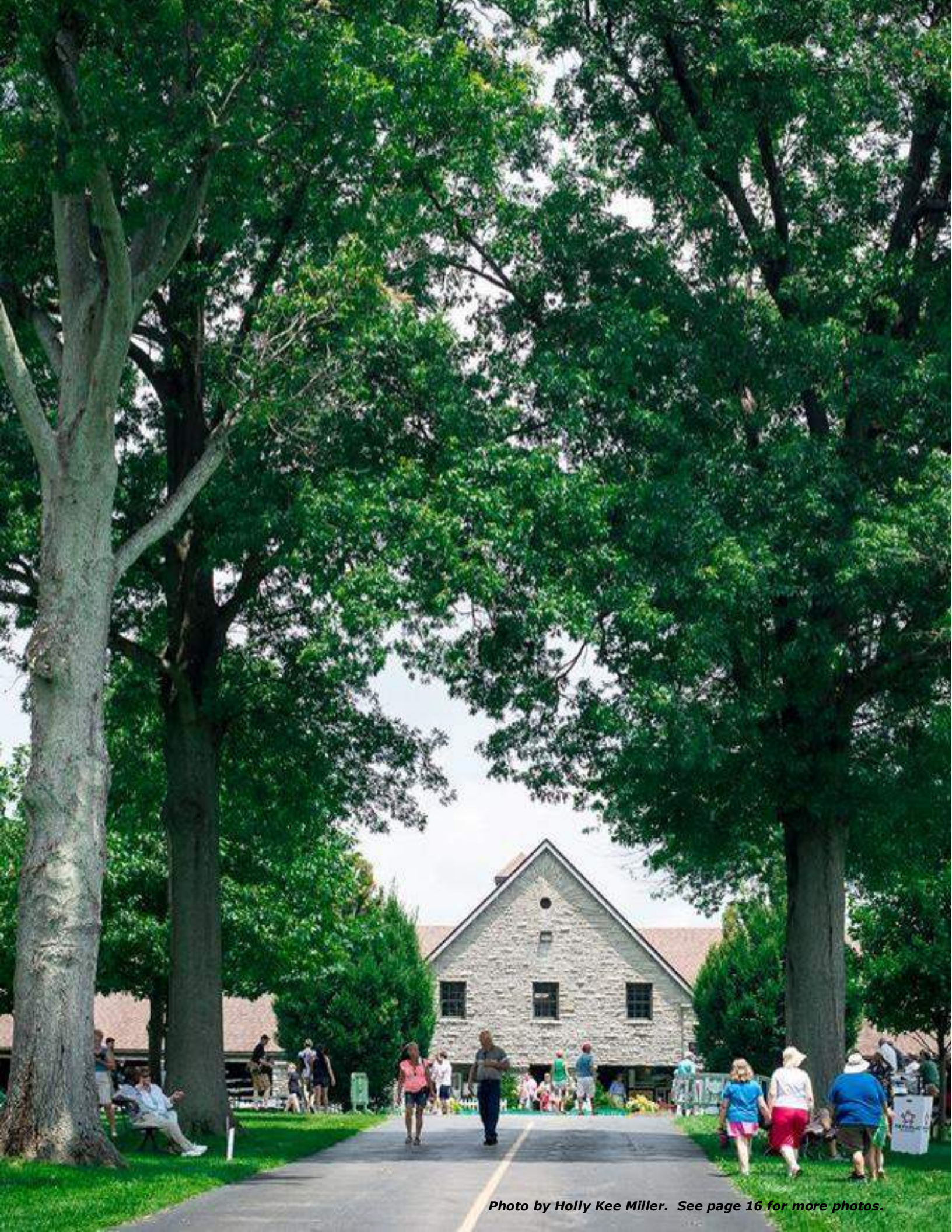
See page 16 for more photos.