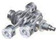
Flat-4 pistons and crank

There have been many optimistic rumors about keeping both power plants, but the way we see it, offering several turbo flat-4s and several normally aspirated flat-6 engines on entry-level models isn't efficient enough in terms of costs, which is why the forced-fed flat-4 may eventually be offered as an exclusive engine option throughout the majority of the Porsche sports car line.