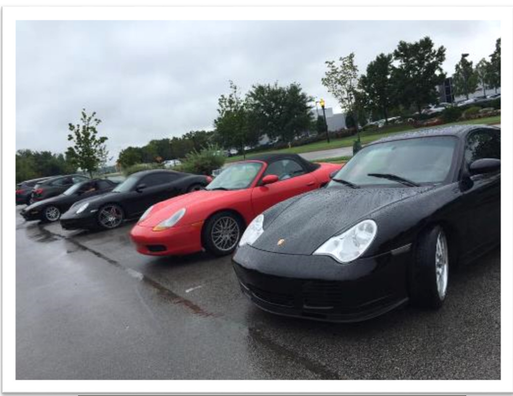
We had a few brave souls set off on this rainy morning for a visit to Newport. ... T.H. Morris