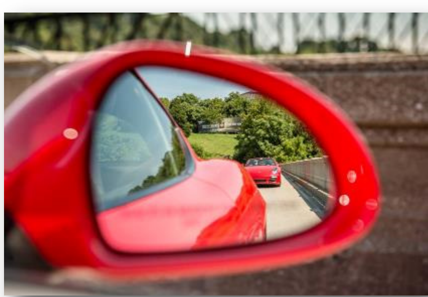
These photos are always my favorite....