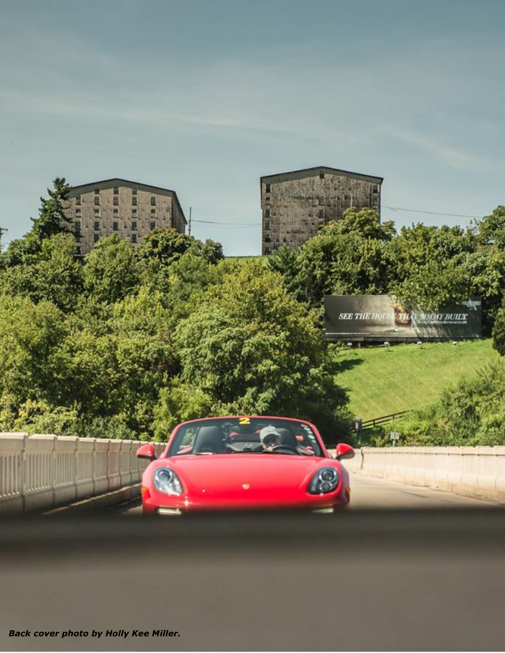
Back cover photo by Holly Kee Miller.