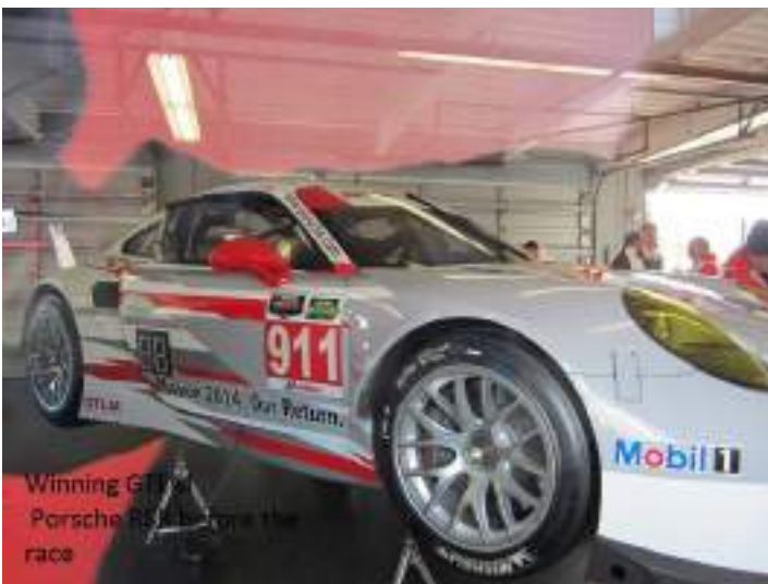
Winning GT3 Porsche RSX from the race