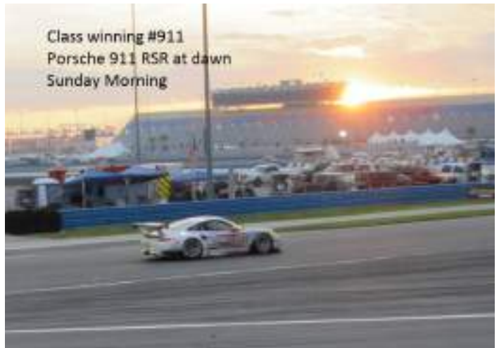
Class winning #911 Porsche 911 RSR at dawn Sunday Morning