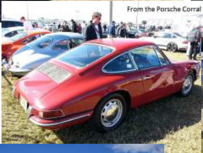
From the Porsche Corral