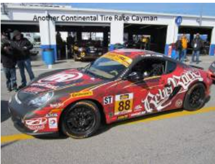
Another Continental Tire Race Cayman