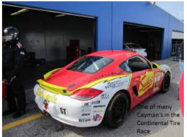
One of many Cayman's in the Continental Tire Race