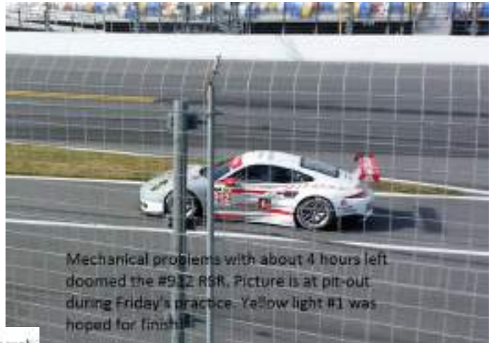
Mechanical problems with about 4 hours left doomed the #912 RSR. Picture is at pit-out during Friday's practice. Yellow light #1 was hoped for finish.