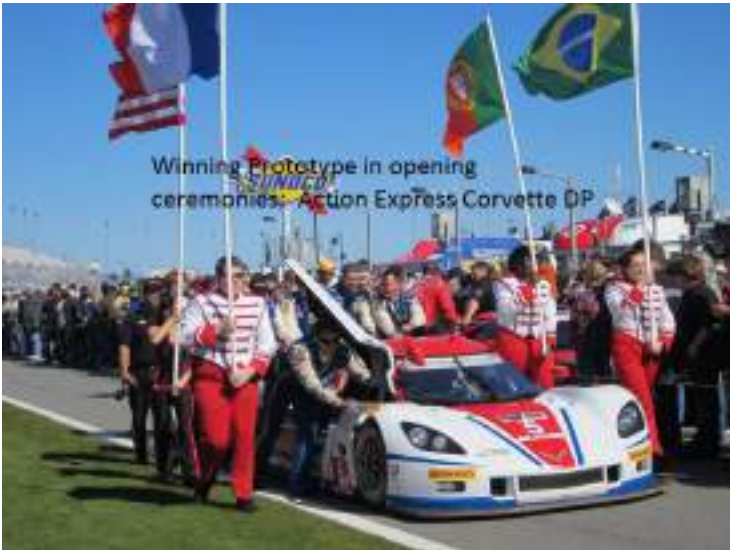
Winning Prototype in opening ceremonies: Action Express Corvette DP