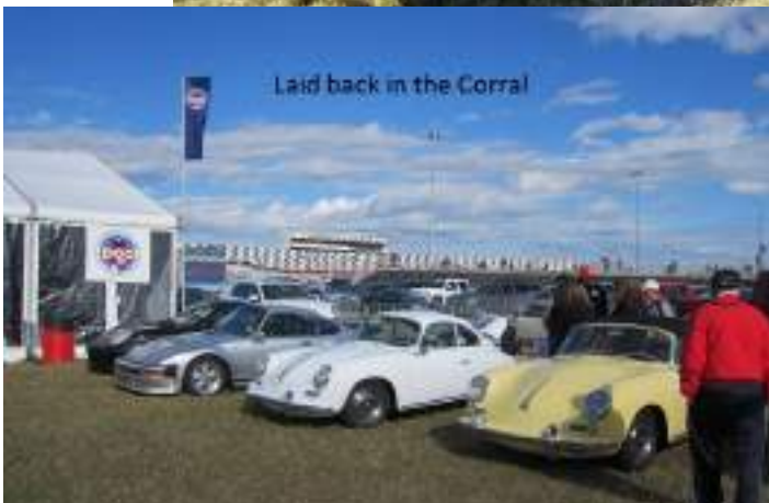
Laid back in the Corral