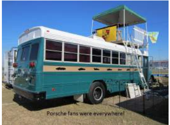
Porsche fans were everywhere!