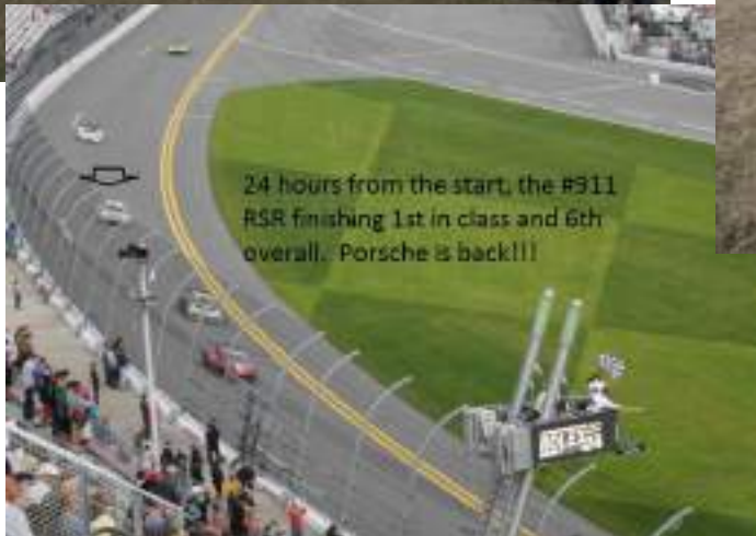
24 hours from the start, the #311 RSR finishing 1st in class and 6th overall. Porsche is back!!!