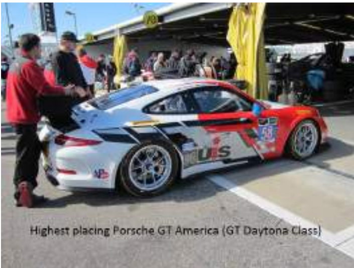
Highest placing Porsche GT America (GT Daytona Class)