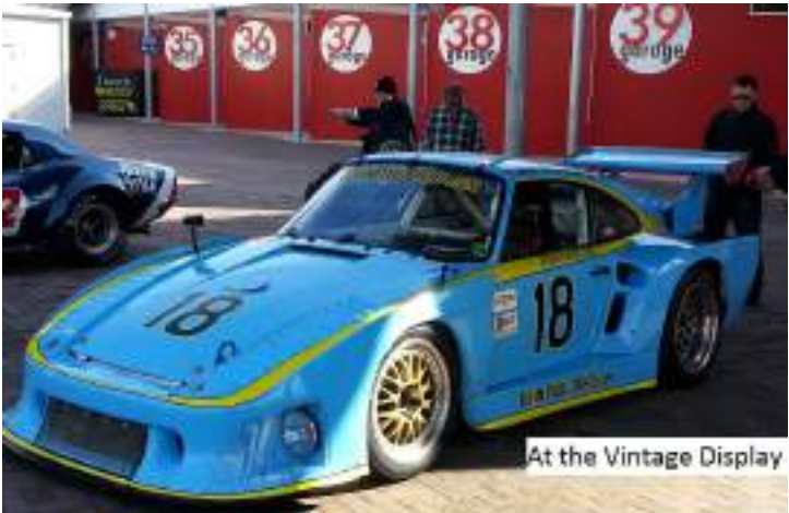
At the Vintage Display