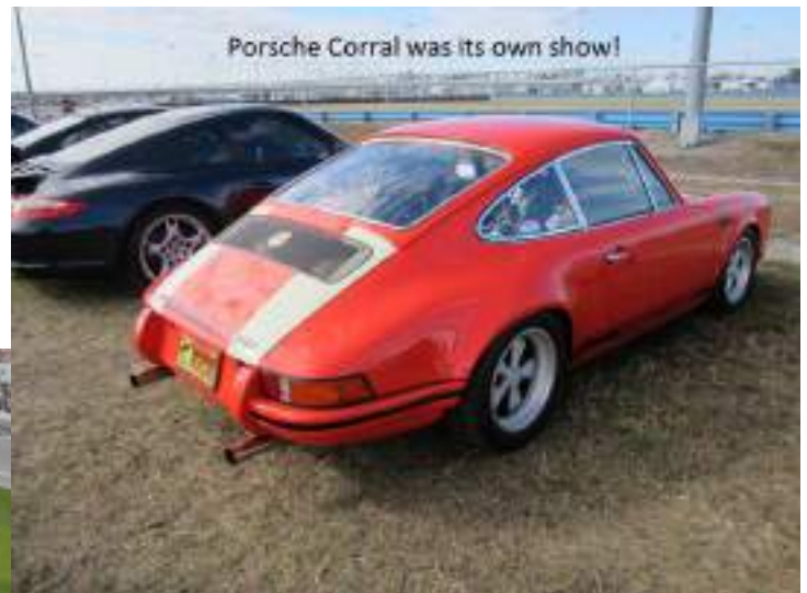
Porsche Corral was its own show!