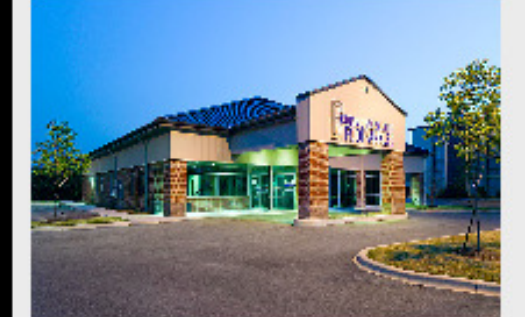
Office Retail Centers Medical Churches Manufacturing Warehouse Banks Schools