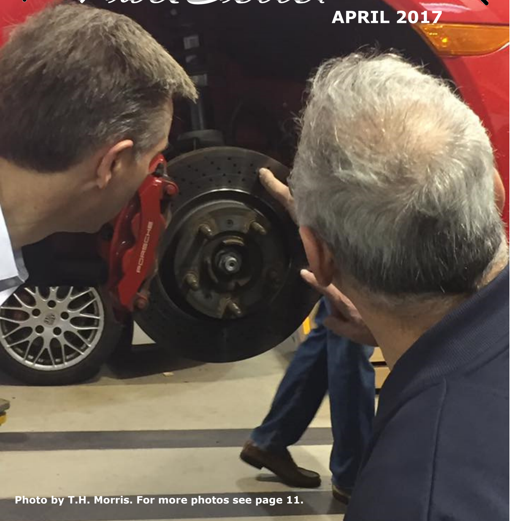
For more photos see page 11.