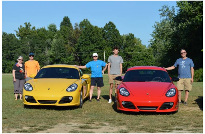
Drivers & Passengers