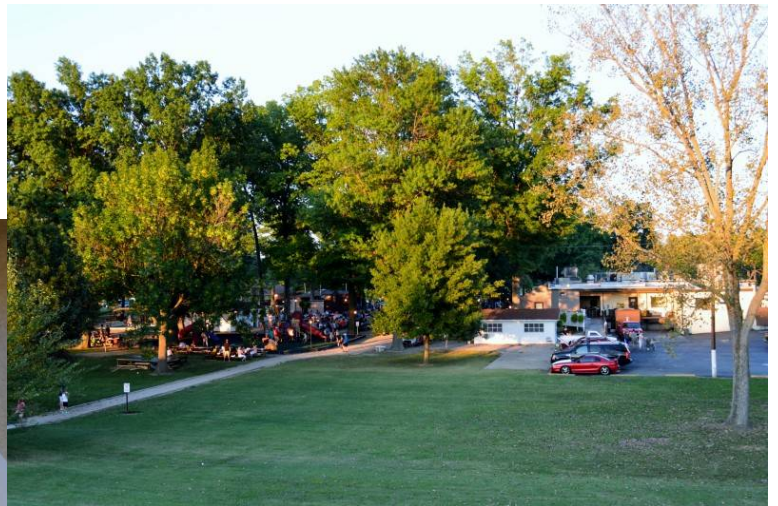
After dinner we checked out the view from the back of the restaurant - a great day for a drive to Mike Linnig's!