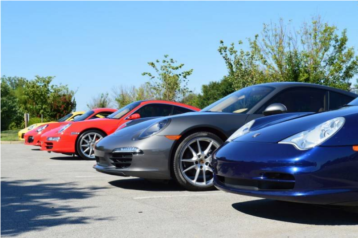
Porsches meeting at the park across from Bluegrass Motors.