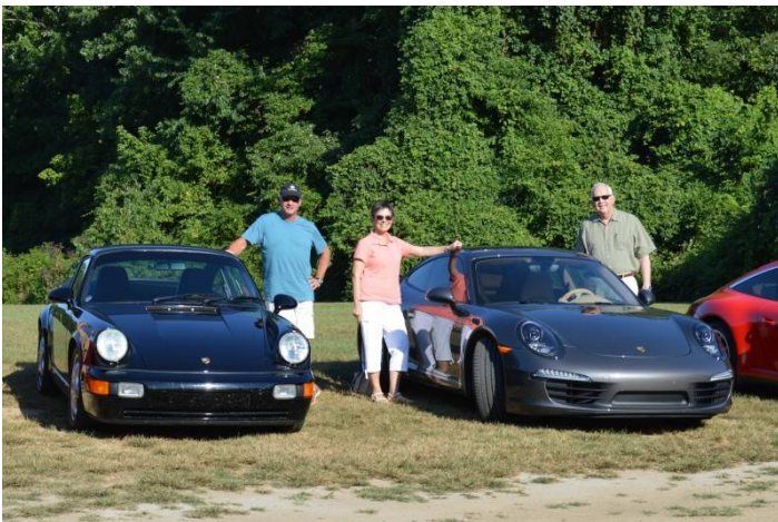
Happy Porsche Owners!