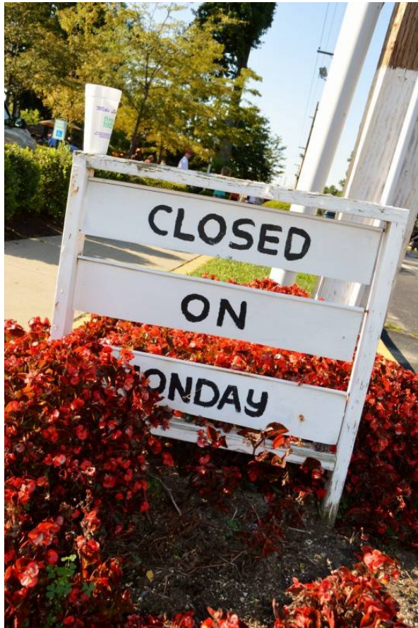
Good thing it's Saturday! ;)