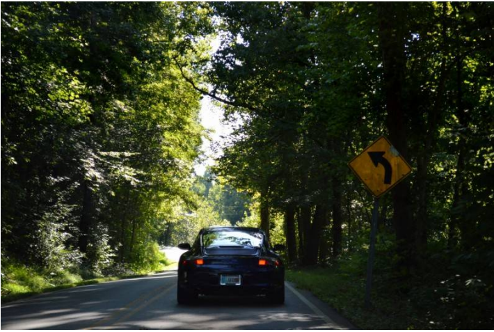
A beautiful tree-lined country road just off Stonestreet.