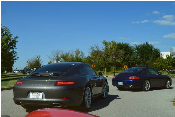
Lining up to head out of the park.