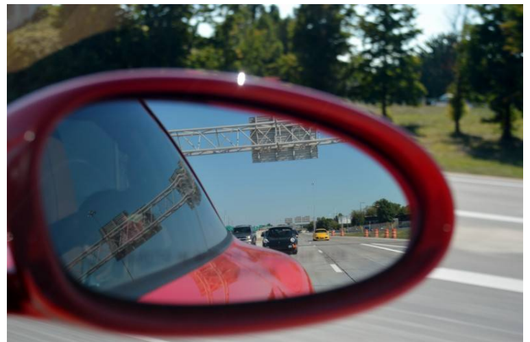
Porsches taking over the Watterson!