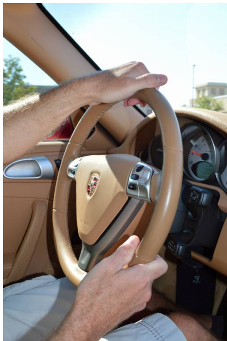
Hands on wheels - let's drive!