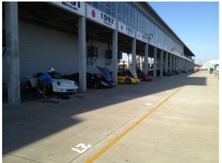
The IROC and line up of Vettes.