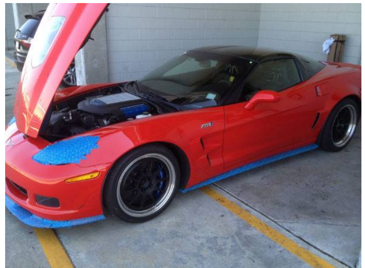
Extremely quick 2010 ZR1 Vette.