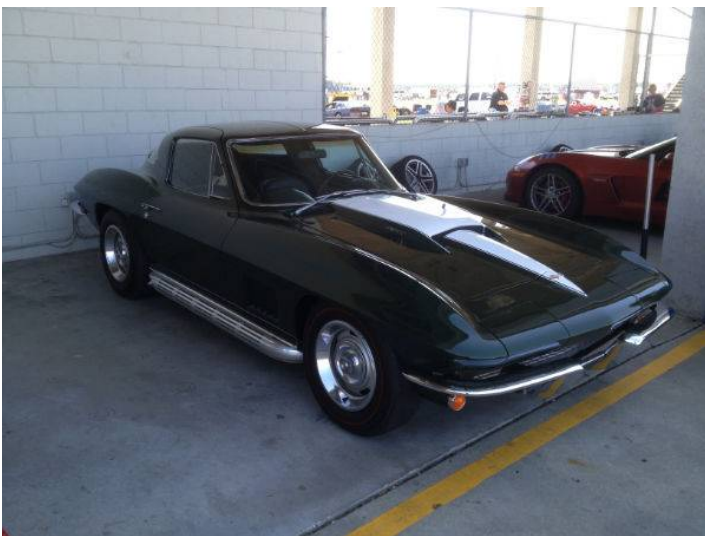
Sweet big block did not run but sounded good.