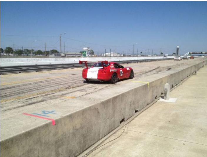
Panoz racer was quick.