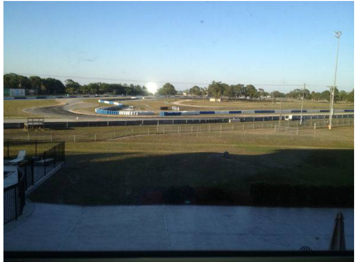
Infamous turn 7 at Sebring.