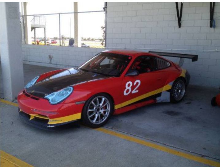
2004 GT3 probably had the quickest laps on the track.