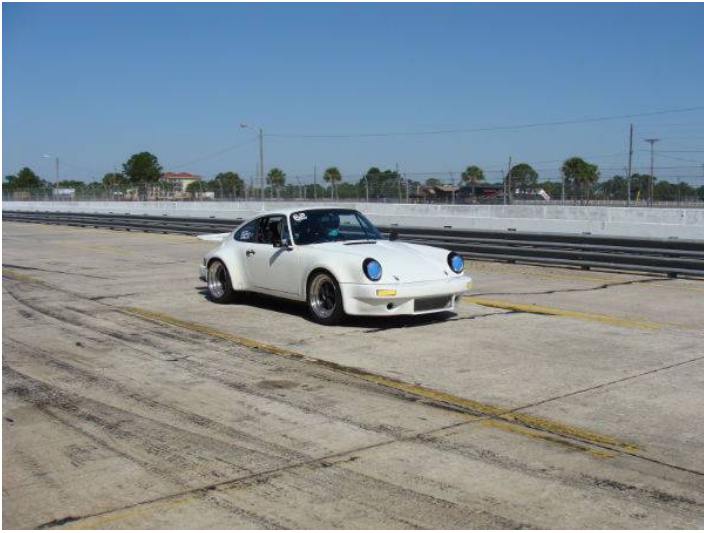
Headed out on the track.