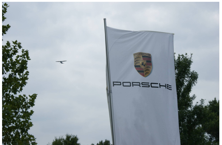
A plane flying overhead from the nearby Lexington airport.