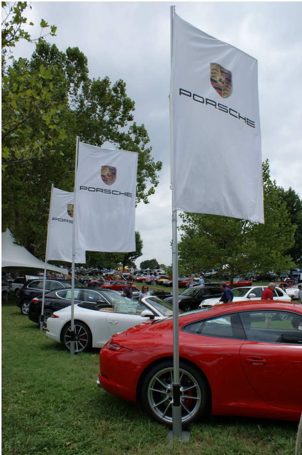
Porsche line-up near the end of the show.