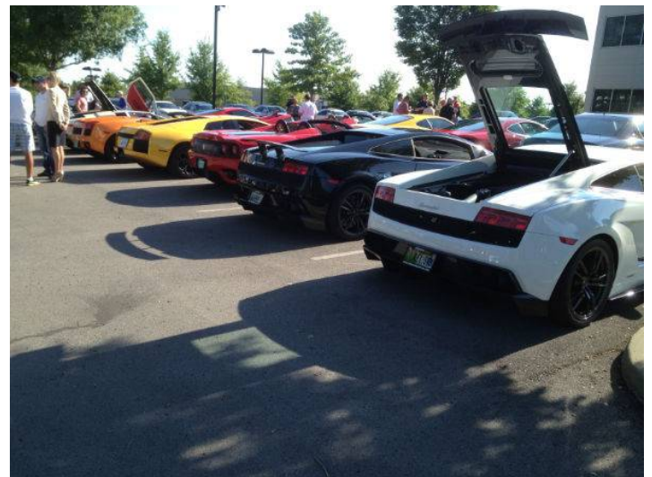
Underground Racing twin turbo 800-1500HP Superleggera