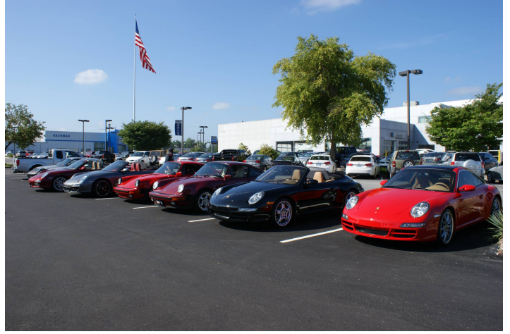
The club meeting at Dairy Queen before the drive.