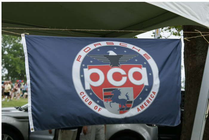
The PCA banner.