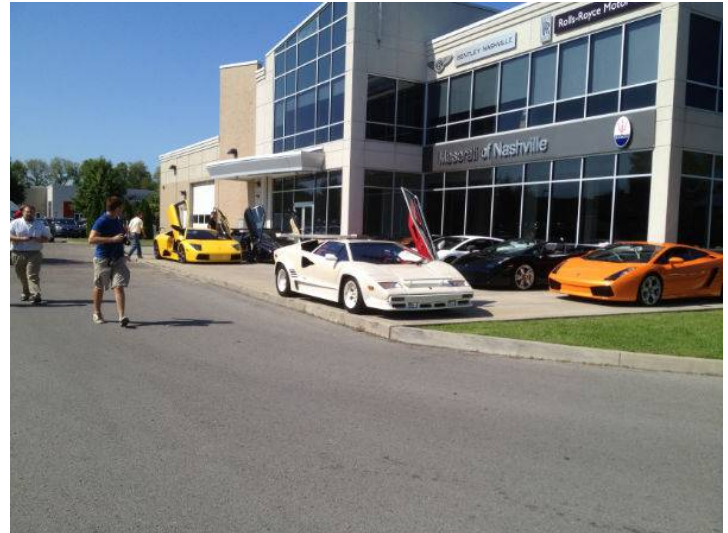
Lambo photo-op in place