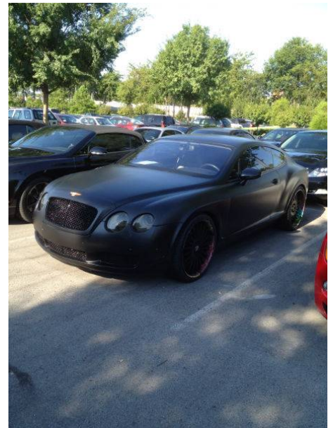
Bentley wrapped Clown car