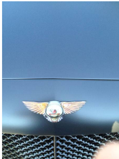
Bentley Clown on Hood