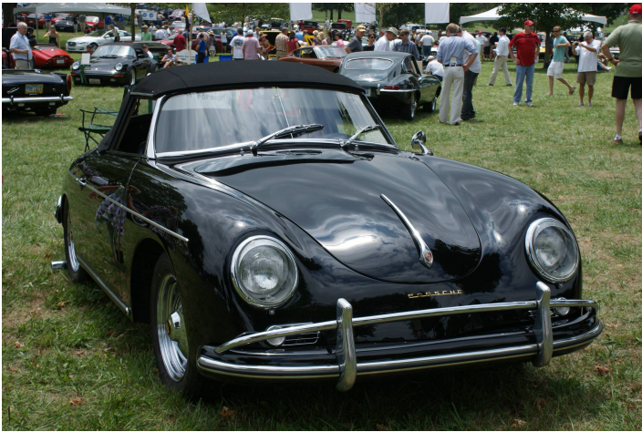
Porsche 1600 Super that was in the Concours competition.