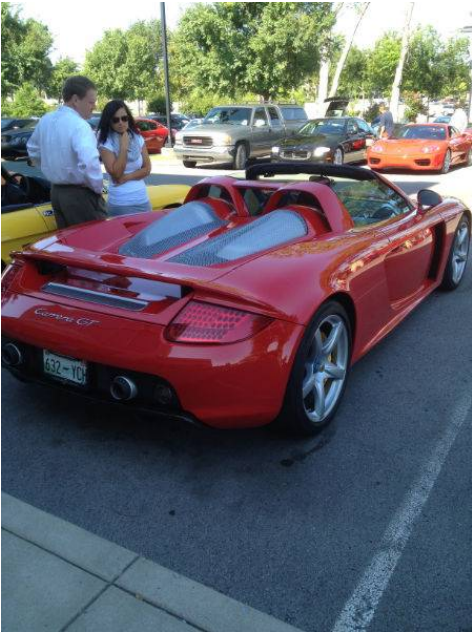
Dario's Porsche GT2