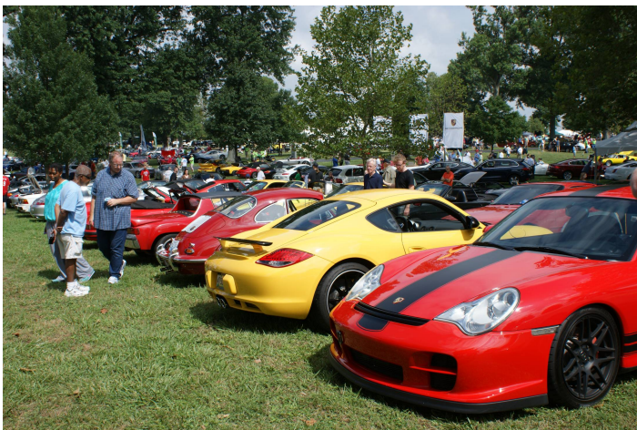
The line-up of Porsches after arriving at the Concours.