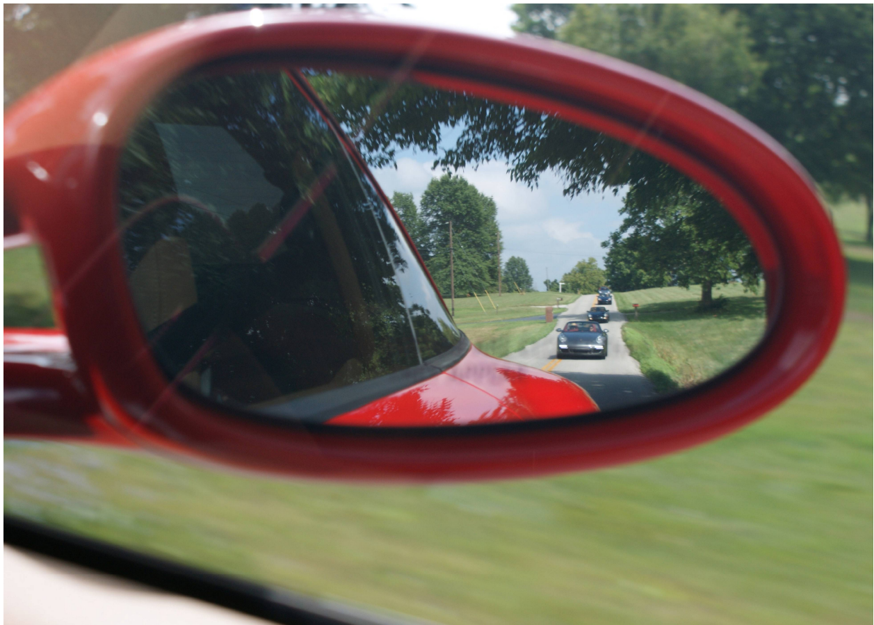
A shot of the cars behind us on the drive in my rearview mirror.