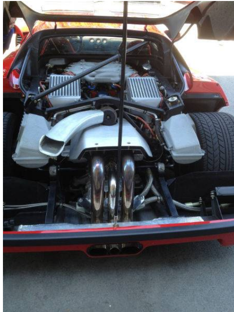
F40 Ferrari twin turbo engine