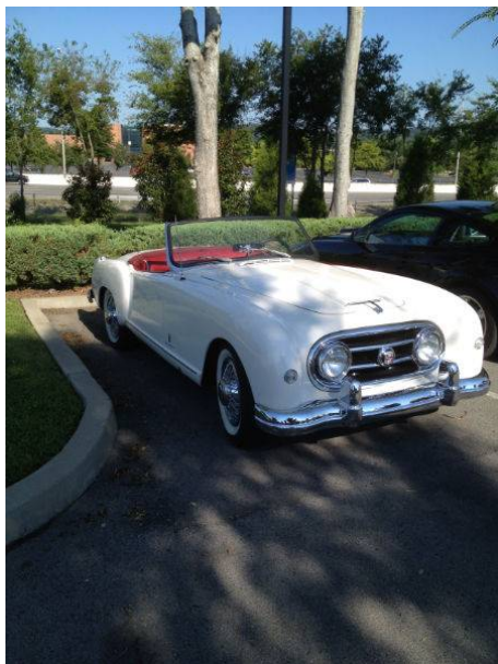
1952 Healey Nash

Oh, and yes, the coffee and crumpets were good as well.