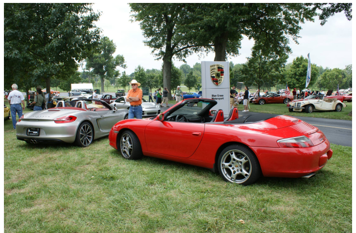
Bluegrass Motorsport cars at the Keeneland Show.