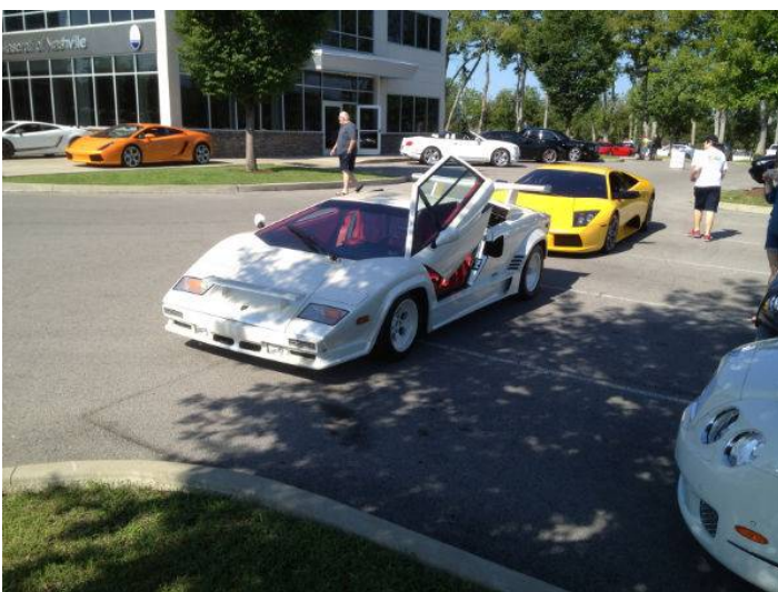
Stephen's 1988 Lambo Countach 5000