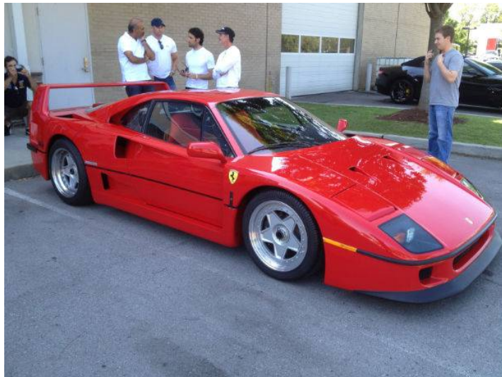
F40 ex-Lexington owner and Dario Franchitti