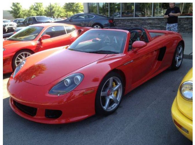
Dario Franchitti Porsche Carrera GT