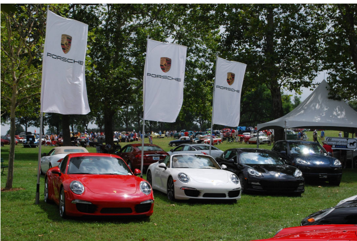
Blue Grass Motorsport is the Sponsor.