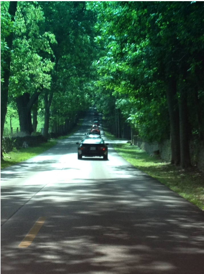
Driving on the nice tree-lined road.