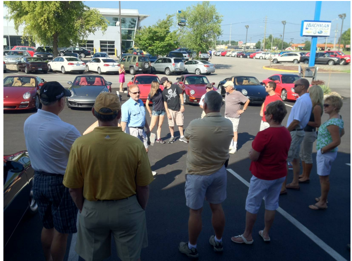
Members meeting before the drive.