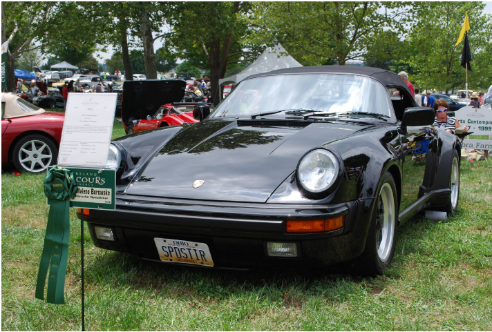
A 1989 Speedster.