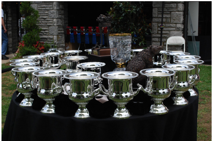
Shiny trophies just waiting to be handed out.