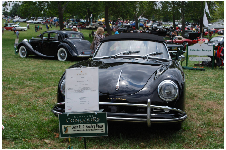
A very black 1959 356 Convertible D.