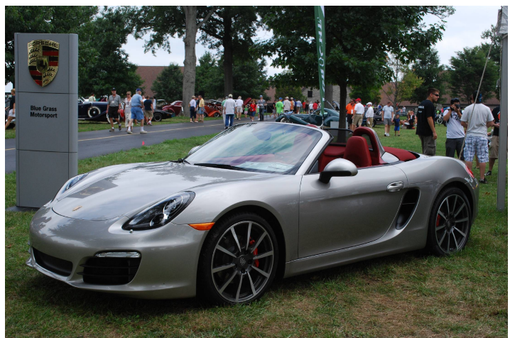
The new Boxster.